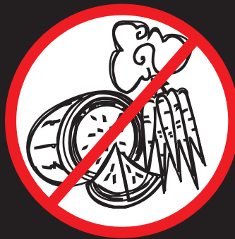
Fruits & Vegetables