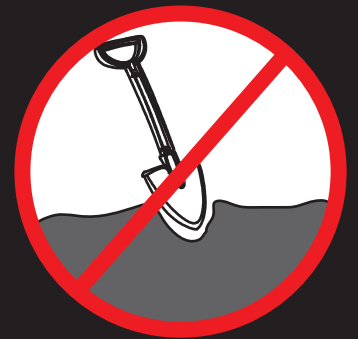
Dirt & Stones

Please prepare your yard waste properly.